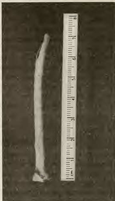
Fig. 4. Left ulna of little bustard ( Otis tetrax ) from Malak Preslavets (6 000 — 4 000 B.C.).

mation available so far, the species has inhabited predominantly the steppe regions of Dobrudzha (NE Bulgaria). The mentioned sites are an indication of wider distribution in the past of the great bustard in the plane openlands of the Northern and Southeast Bulgaria. Bone remains of O. tetrax from Neolithic age were found at the ancient settlement of Malak Preslavets (NE Bulgaria). The little bustard has disappeared as nesting species in the country from the same region during the 60-thies of this century (БОЕВ, 1985 e).